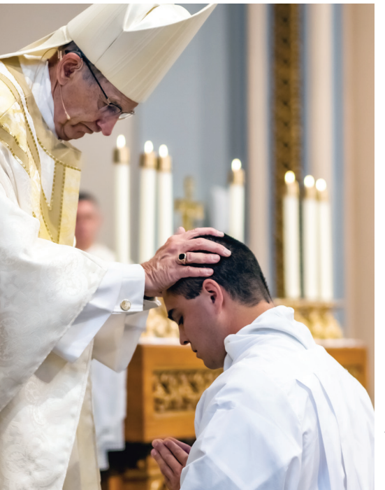
Laving on of Hands

The role of the transitional deacon includes assisting priests in proclaiming the Gospel, preaching, baptizing, assisting at and blessing marriages, presiding at funerals, administering to parishes, and dedicating themselves to any of a variety of ministries of charity.