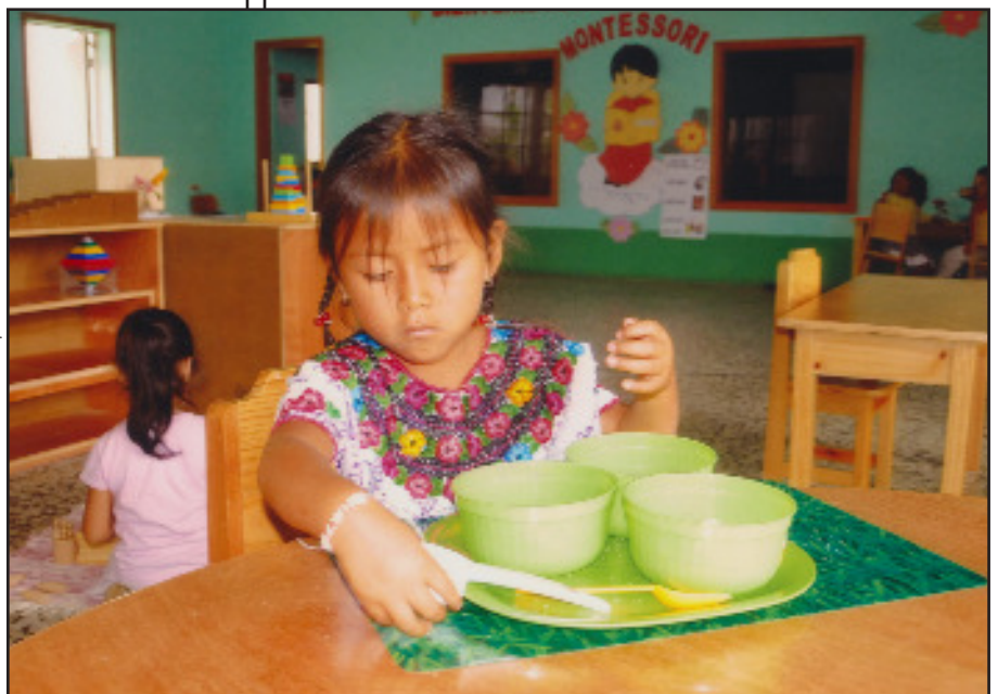
Early Learning Center Classroom (Montessori)

Today we begin the new school year with 116 schools opening doors to students on several levels of education in the school district of San Lucas Toliman. A total of 490 teachers will be preparing for the eager students. Those teachers will be received a total of 10, 612 (5,375 girls/ young women and 5,237 boys/young men) into their classrooms on