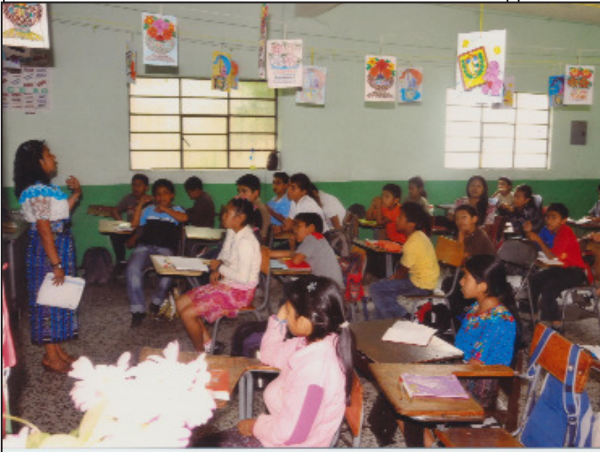
Typical Colegio classroom

Solola and continued teaching in that community until 1947.