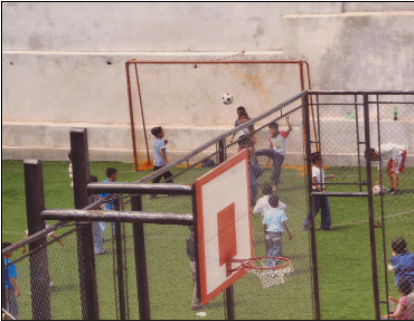
Playgroup/Physical Education Area (limited space calls for fences)