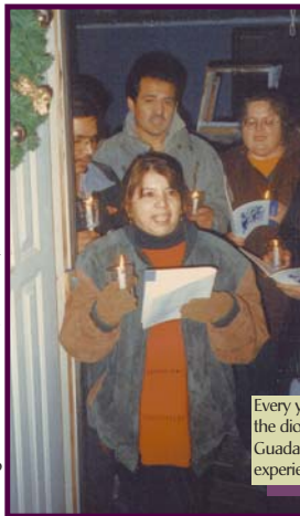
Every year in December, the Hispanic community of the diocese celebrate the Feast of Our Lady of Guadalupe, and Posadas which defines the Hispanic experience of Advent.

There is a growing Spanish-speaking population in the Diocese. Many of these people are migrants or immigrants from Texas or Mexico. There are also immigrants from Central and South America, Southeast Asia and central Africa. Over the past six years, a number of parishes in the Diocese have worked to provide a welcoming and receptive oasis for these migrants and immigrants. At present, a Task Force is studying ways to expand and improve this ministry. The Diocese has also committed to conducting an on-site Spanish Immersion Course to increase the number of Spanish-speaking ministers.