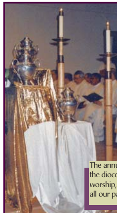
The annual Chrism Mass gathers the faithful of the diocese with the bishop to celebrate, to worship, and to consecrate the holy oils used in all our parishes throughout the year.