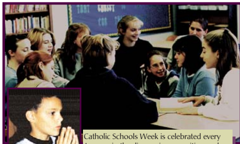
Catholic Schools Week is celebrated every January in the diocese in recognition and support for Catholic schools nationwide.

As the Diocese looks to the future of Catholic schools, the realities of a declining school-age population and an unstable agricultural economy will mean that the concept of "area schools" will need to be addressed. In order to preserve their futures, some changes will need to be made in the structure of administration, teaching staff, programs, and subsidy.