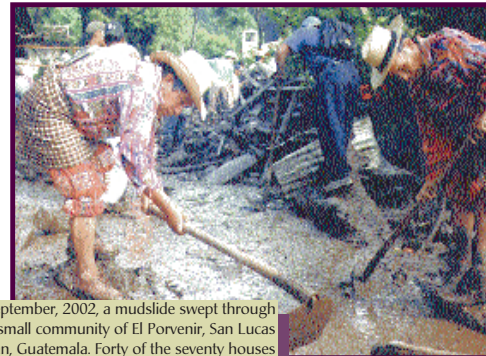
In September, 2002, a mudslide swept through the small community of El Porvenir, San Lucas Toliman, Guatemala. Forty of the seventy houses were simply swept away.

Women (CCW) and the Knights of Columbus (KC). Thousands of members of the Diocese are involved in the activities of these groups.