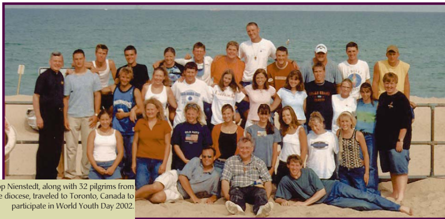
Bishop Nienstedt, along with 32 pilgrims from the diocese, traveled to Toronto, Canada to participate in World Youth Day 2002.